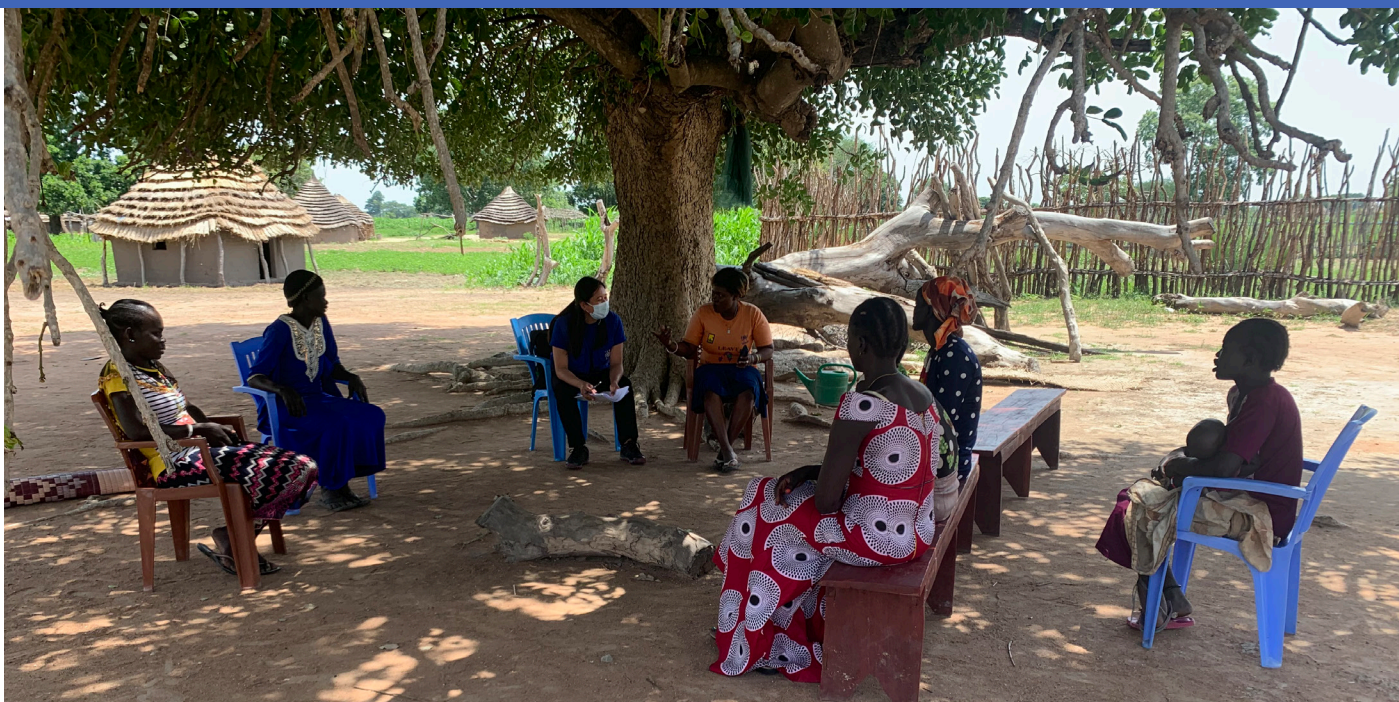
IOM Pipeline's PDM team conducting FGD with beneficiaries of MHM kits in Pankot Boma, Tonj North