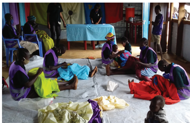
Women groups in Hai Masna working on their embroideries supported by the Women Participation Project