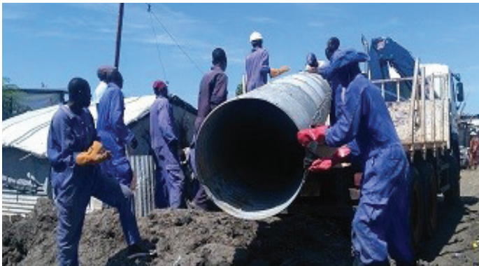
IOM CCCM Care and Maintenance casual labors installing a new culvert in the Malakal PoC site

On June 3, joint IOM CCCM, S/NFI and OXFAM Protection teams concluded multisectoral mobile responses in Greater Baggari, Bessilia and Bazia Payams of Wau County that were supported by the contribution from the South Sudan Humanitarian Fund (SSHF). Through this project joint teams were able to conduct series of multisectoral needs assessment and subsequent response missions to remote, new and underserved displacement sites within three payams in Wau County. Core project deliverables were establishing coordination and service monitoring mechanism, supporting self-governance, and setting up accountability mechanism across the six project sites. As part of the capacity building support to site self-management committees, through a technical capacity CCCM team constructed a community center in each of Gedi, Ngoku and Mboro sites. These centers will provide an avenue for site level coordination meeting and community engagement activities and will serve as hub for further response and development interventions in the sites.