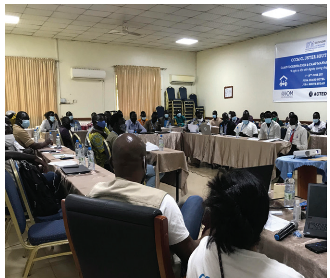
The CCCM Cluster South Sudan orgnaized a two days capacity building training for CCCM actors in Juba in June 2021

Care and Maintenance teams in Bentiu and Malakal are scaling up the mitigation works to ensure safe access and environment is maintained during the rainy season which peaks from June to September. The team prioritized the improvement of camp infrastructures such as drainages and culverts to reduce flood risks. As of the reporting period, a total of 16,911 meters of drainages were rehabilitated, developed, cleaned and reinforced including the primary and secondary trenches, 261 culverts were desilted, cleaned and reinstalled, and 4,751 meters of roads were rehabilitated, leveled and compacted.