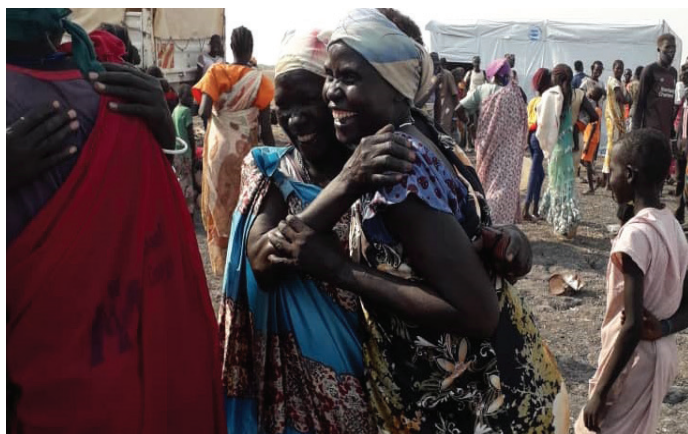
Returnees from Melut reunion with relatives from Baliet at the Baliet reception point managed by IOM CCCM surge team

Following the successful selection of 40 women including 10 with disabilities - 25 from Naivasha and 15 from Masna IDP site – as project participants for phase 6 of the IOM Geneva-USAID “Safe from the Start” partnership Women Participation Project in Q1 of 2021. During the second quarter, IOM CCCM team boosted the capacity building component of the project. A series of Women’s leadership trainings were conducted for all participants across the two project sites in April and May. The women were trained in groups to respect C-19 precautionary measures. The two-day training supported by IOM Protection aimed to empower participants by enhancing their leadership skills and awareness of key issues related to gender equality. Business skills trainings were also conducted for all participants across the two project sites. The four-day training, supported by a locally hired trainer with expertise in business, aimed to enhance participants’ knowledge of business practices and provide them with tangible skills to support their small-scale livelihood activities. In Masna following the procurement of sewing and embroidery materials, CCCM team facilitated tailoring skills training targeting 15 women from the site. The trainers were located from the Naivasha participants to promote a mentorship model and peer learning.