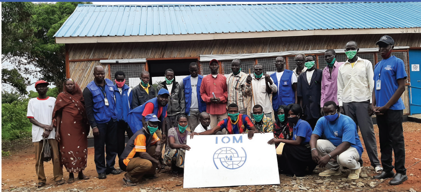
Group photo from the handover ceremony of the Community Center constructed by IOM CCCM Mobile team in Mboro