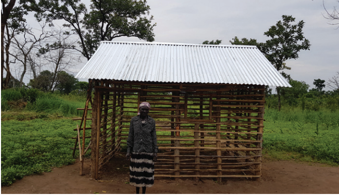
Transitional Shelter construction in Kajo-Keji for the most vulnerable returnees

The S-NFI Cluster responded to the needs of flood and conflict-affected communities across South Sudan. The Cluster partners assisted 371,425 individuals mainly in Central Equatoria, Eastern Equatoria, Jonglei, Warrap, Unity, and Western Bahr el Ghazal during the reporting period. In addition, the Cluster revised the two-year strategy for 2021-2022 in consultation with the Strategic Advisory Group (SAG). The Cluster also finalized a strategy paper for South Sudan Humanitarian Funds (SSHF) First Standard Allocation 2021, securing 3.1 million for S-NFI response in prioritized locations.