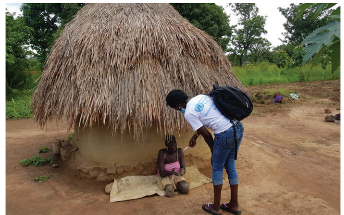
Team verifying the most vulnerable for shelter constructions in Kajo-keji

Based on needs analysis and safety audit, IOM assisted 2,081 IDPs with the provision of restricted vouchers for NFIs support. IOM organized voucher fairs in the IDP camp to empower beneficiaries with the independence of choice regarding what NFIs to buy. Each beneficiary was issued a voucher with a specific amount limit. In addition, local traders were invited to set up their point of sale at the fair. Beneficiaries appreciated the voucher fair, as this has offered the opportunity to decide independently based on their urgent needs and household size.