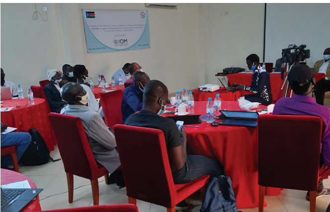
Director-General of Disaster management & DRR National focal point

In coordination with the Ministry of Humanitarian Affairs and Disaster Management (MHADM), the Shelter and Settlement unit organized a one-day workshop on the National Platform for Disaster Risk Reduction. The platform brought together a number of stakeholders from Line Ministries, national, international and UN agencies to build community resilience, prepare and reduce the impact of hazards in South Sudan. 37 representatives from the government, UN, INGOs and NGOs attended the workshop. In addition, IOM extended technical support to MHADM by providing technical resources and capacity building of the Ministry's staff.