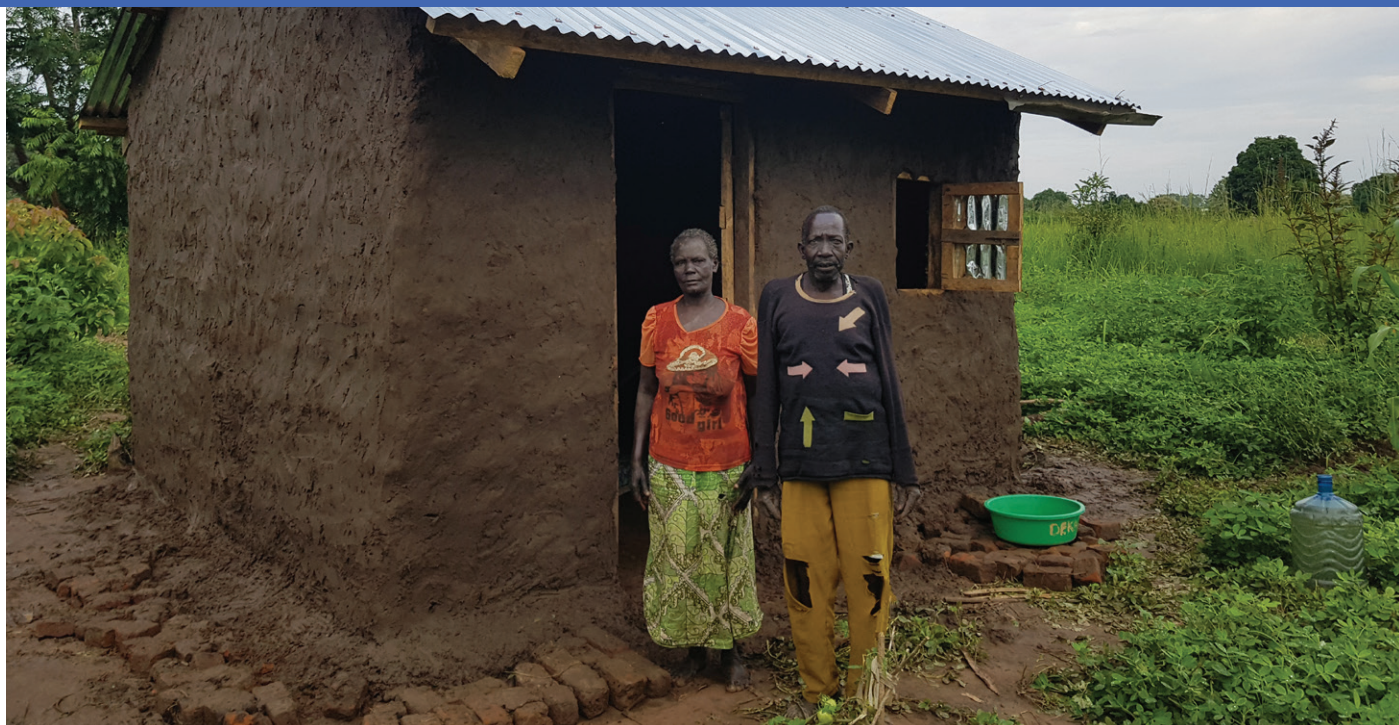
Finished Shelter through community support.