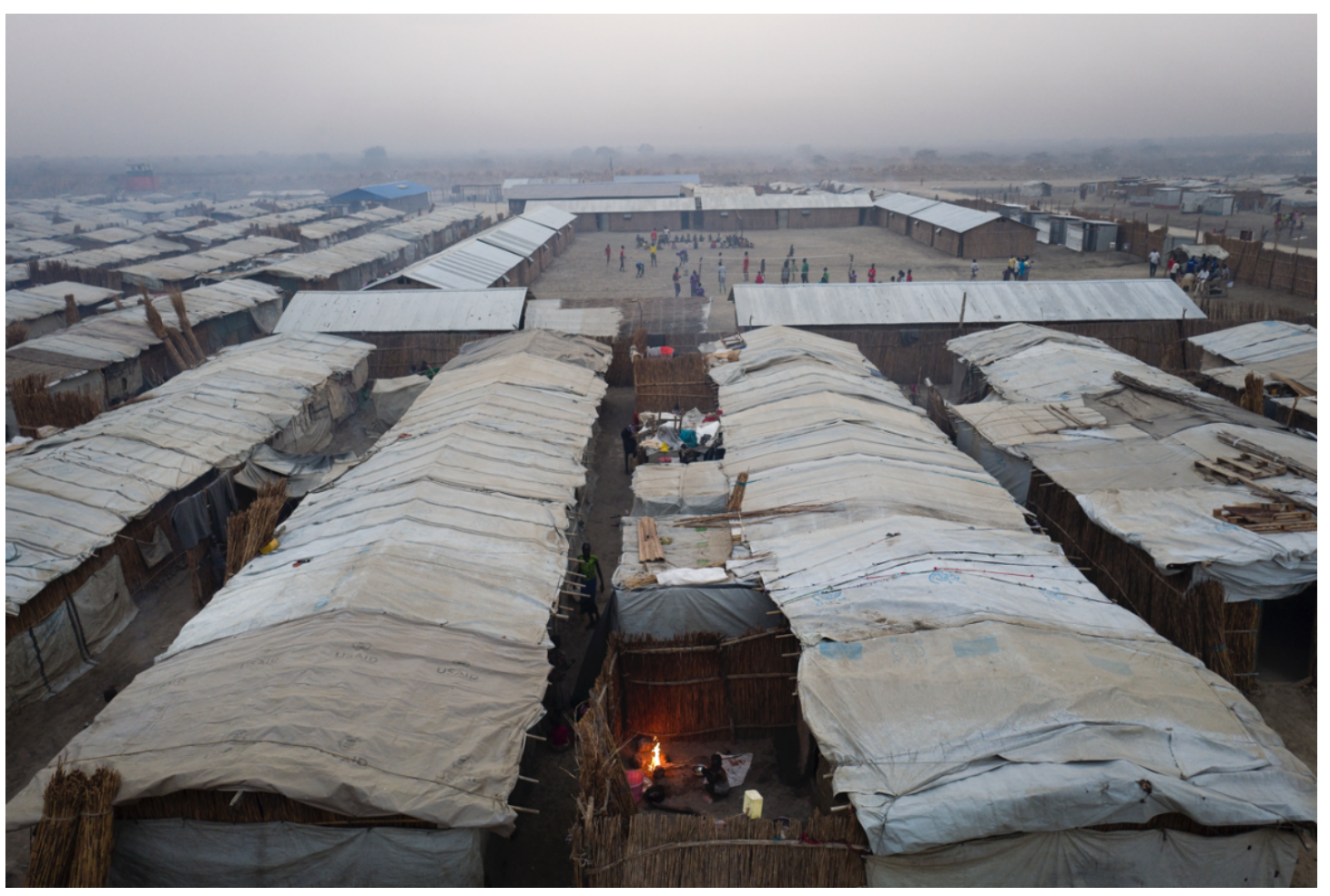
South Sudan/Mercy Corps/D Nahr

It should be noted that this research was conducted in communities that are predominantly ethnically Nuer, and many of the narratives presented in this series are deeply rooted in this unique context. While the implications of the findings in this report are relevant to audiences interested in diverse contexts in South Sudan and beyond, it is important to note that the specific narratives presented in this report may manifest differently in different contexts.