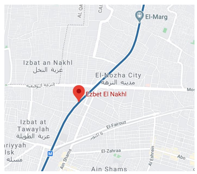
Ezbet el Nakhl neighborhood in Cairo.

The lack of women on our team and our inability to connect with women-led refugee groups meant we could not fully explore how gangs affect the girls and young women growing up in these neighborhoods. Nor were we able to delve into the lives of girl gang members. However, our informants hinted at issues of gender-based violence (GBV) that are somewhat hidden to humanitarian agencies. Agency reports suggest that girls and young women face high levels of GBV both from their own communities and from local Egyptians.<sup>8</sup> However, our interviewees usually referred to this issue as "early pregnancies" among teenagers rather than GBV. While some of these "early pregnancies" were girl gang members, many were not, suggesting that GBV is not simply a gang-related issue. Research in other contexts highlights how recurrent violence can harden masculinities and lead to further violence. It is possible that recurrent gang violence (in addition to other forms of violence affecting refugees) could contribute to high rates of GBV. These issues require further research, particularly if effective programming is to be developed.