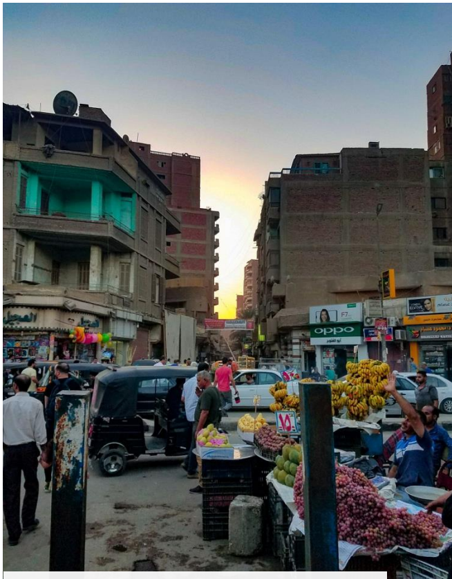
Ain Shams Market in Cairo.

Without using leading questions, we explored with our informants their views on what manhood means to young people and whether masculine norms influence violence between gang-involved young people or help explain why some young people join these groups. Their views were diverse. Some informants saw masculinity as a relatively minor factor compared to larger concerns such as needing protection or a source of income for youth. However, most of our informants, and especially former gang members, thought notions about manhood play a crucial role in the reproduction of violence and in youth joining groups. Even those who said manhood plays no role often indirectly supported this idea, but they did not use the language of masculine norms or gender.