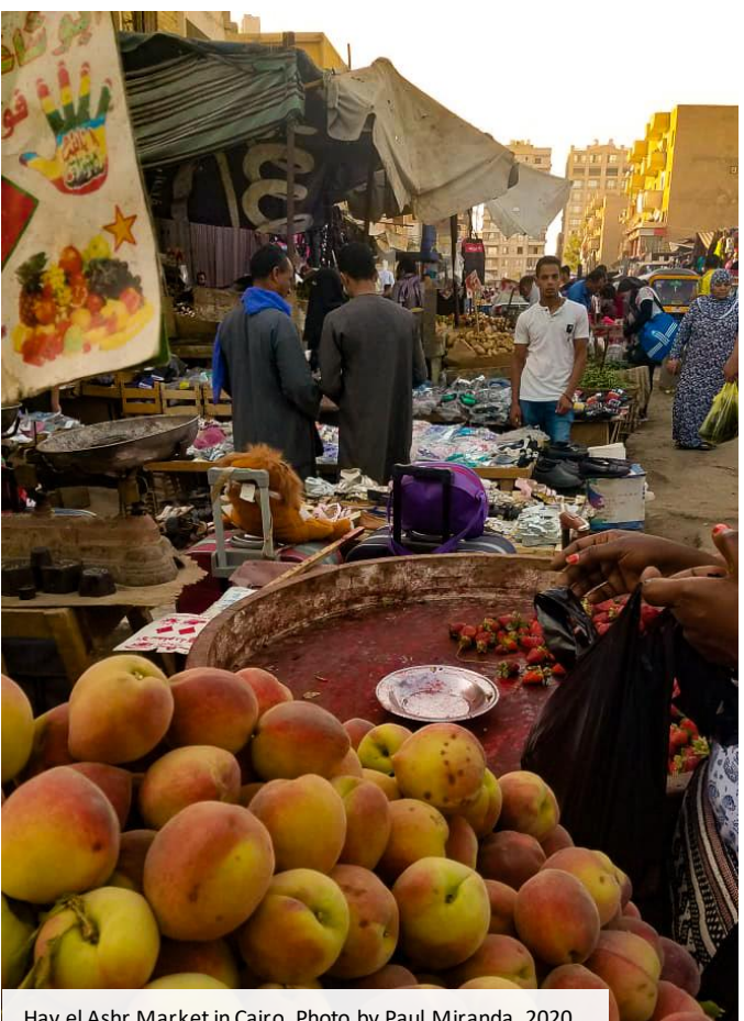
Hay el Ashr Market in Cairo.

One pastor suggested that the best way to minimize risk would be to have the VIs and OWs be former gang members or "gang-adjacent" people. But they should "work under the umbrella" of a wellrespected pastor or community leader who would lend his or her name to the project to give it further legitimacy and credibility and act as the project's guardian.<sup>125</sup>