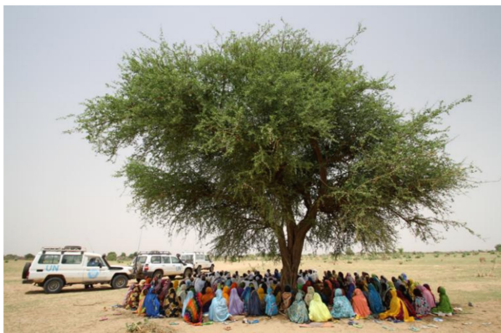
A meeting with returnees in Borota, eastern Chad. The key concern discussed was the lack of clean water.