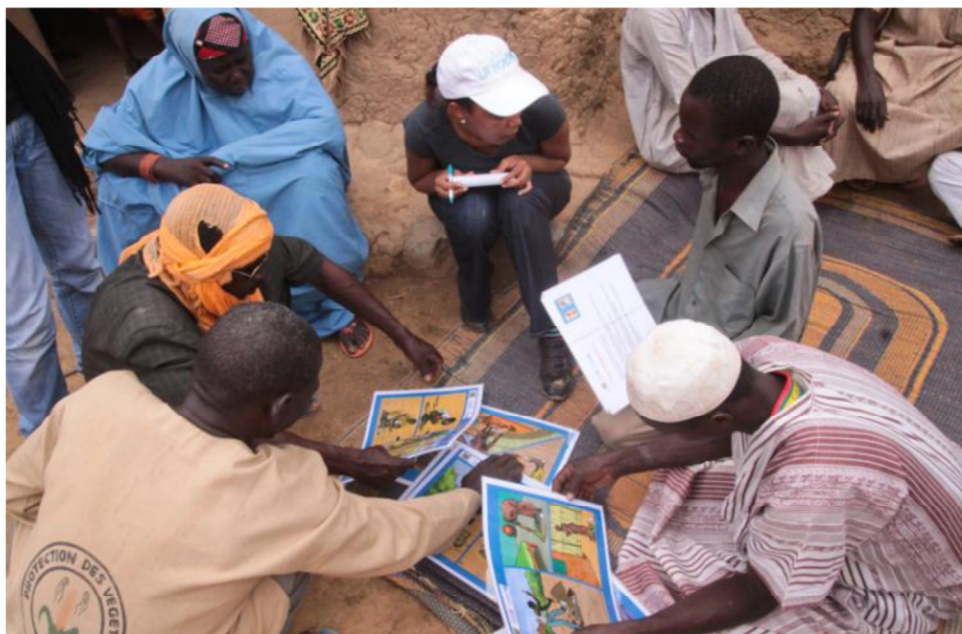
Aid workers conducting cholera awareness campaigns to at-risk communities in Niger. In 2012, nearly 4,000 cholera cases and over 80 deaths have been reported, mostly along the Niger River which recently flooded after heavy rains in the west of the country.

Finally, each cluster is also responsible for integrating early recovery from the outset of the humanitarian response. The RC/HC has the lead responsibility for ensuring early recovery issues are adequately addressed at country level, with the support of an Early Recovery Advisor. The Advisor works on inter-cluster early recovery issues for a more effective mainstreaming of early recovery across the clusters and to ensure that multidisciplinary issues, which cannot be tackled by individual clusters alone, are addressed through an Early Recovery Network 13 . Exceptionally, where early recovery areas are not covered by existing clusters or alternative mechanisms, the RC/HC may recommend a cluster be established in addition to the network to address those specific areas.