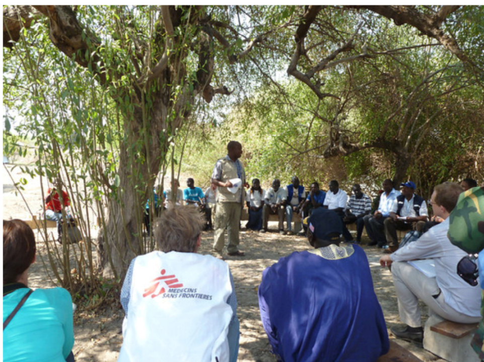
Humanitarian workers at a coordination meeting in South Sudan's Pibor coordination hub, Jonglei State, where inter-communal violence affected nearly 170,000 people. Aid organizations have recorded 165 violent incidents with humanitarian consequences in the first five months of 2012 alone.