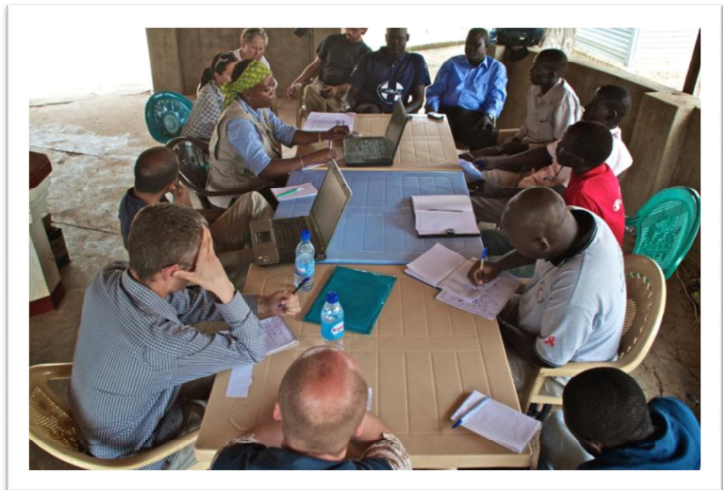
Coordination meeting at Agok in Warrap state, South Sudan. Thousands of residents of Abyei settled in Agok after being displaced by armed clashes in 2011.

The terms of reference of sub-national clusters should follow the core functions of the cluster at the country-level, while at the same time being streamlined and tailored to local operational realities. Accordingly, the working methods of sub-national clusters must be light and focused on service delivery and operational activities; ensuring reporting and information sharing with the national cluster and, through that mechanism, other sub-national clusters; and promoting the involvement of the affected populations in cluster activities to ensure that humanitarian actors respond adequately to their actual needs.