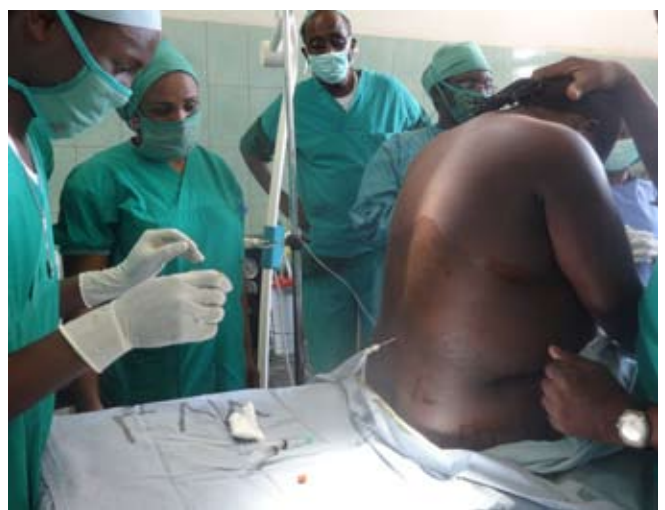
Figure 1. Trained nurse conducts spinal anaesthesia as part of task-shifting

Task-shifting in surgery raises important ethical issues, as patient risk could be increased when the operating clinician lacks the expertise of a fully trained surgeon. However, comparative studies in Mozambique [1] and Tanzania [2] indicate that postoperative outcomes do not