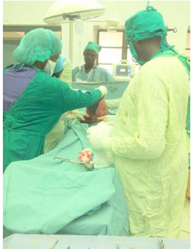
Figure 2. Lady with a uterus that had entirely herniated through the abdominal wall undergoing caesarean section

The scientific studies mentioned show that mid-level health professionals carry out most of surgical procedures outside urban areas in several African countries. They are key surgical professionals in rural areas where doctors are scarce. The results of our studies also show that técnicos de cirurgia in Mozambique performed 92% of Caesarean sections in district hospitals and in Tanzania AMOs performed 85% of Caesarean sections, 94% of repairs of ruptured uterus, 86% of removal of ectopic pregnancy and 70% of hysterectomies in Mwanza and Kigoma regions in Tanzania [8, 2].