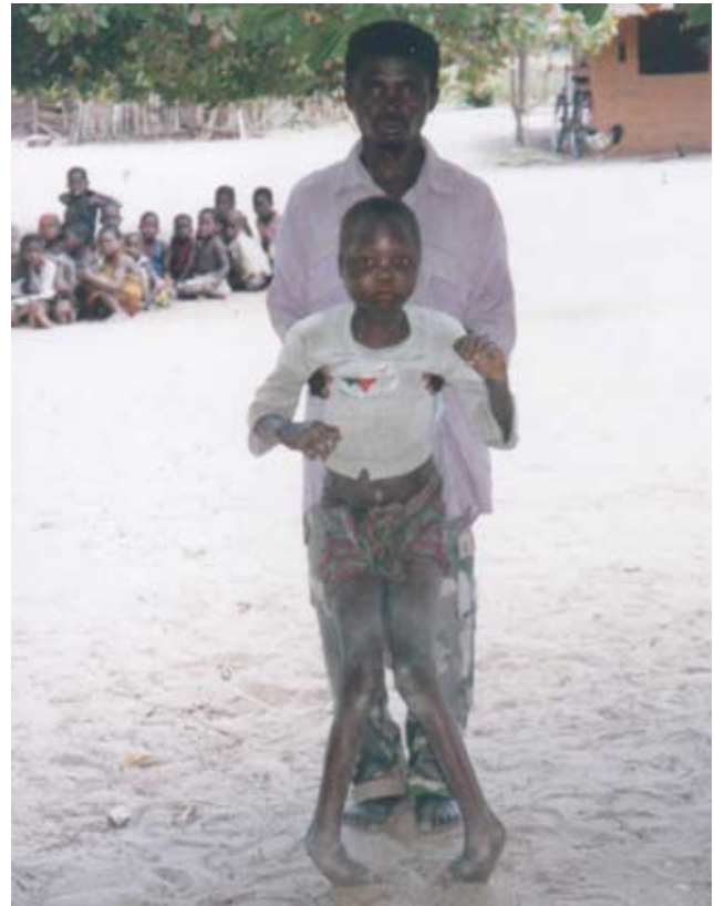
Figure 1. Boy with konzo supported by his father.