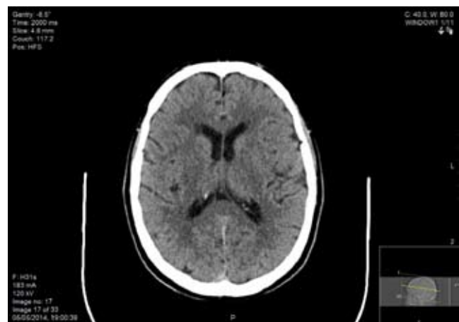
Figure 1. Non-enhanced CT of the brain demonstrating small vessel disease.

On admission he was found to have bilateral facial weakness, with the right side affected more than the