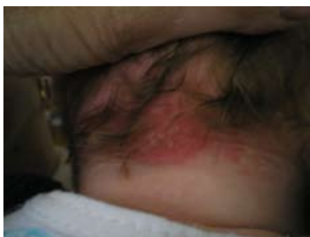
Figure 1. Scalp psoriasis in a new-born: erythematous plaque covered by adherent scales in the occipital area.

Case: A 6-day-old full-term female baby, from a non-consanguineous marriage, presented with erythematous scaly lesions on the occipital area observed by the mother since birth. She was in good health, there were no other skin lesions, no nail deformities and no xerosis (dryness) over the body. Systemic examination of the child was normal. The parents had no dermatological diseases. There was no family history of psoriasis.