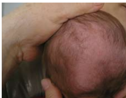
Figure 2. Same child 10 days of treatment with topical steroids class II (Credit: Anca Chiriac).

The parents did not permit a biopsy, mycological examination was negative and the lesions cleared rapidly under topical steroids class II for 7 days and emollients for several weeks. Figures 1 and 2 show the child's scalp on admission and 10 days later.