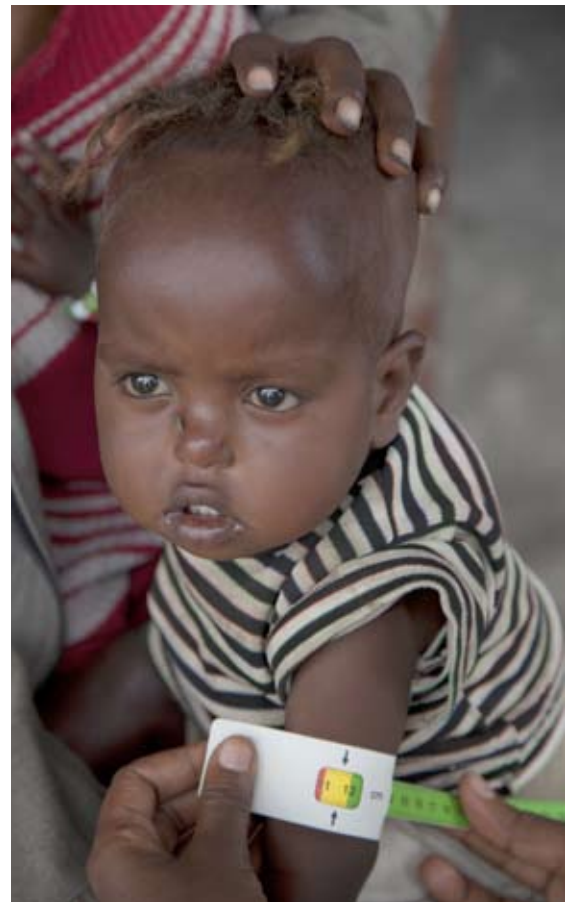
Figure 1. Measuring MUAC. The colour on the tape is orange so the child has moderate acute malnutrition (MAM).